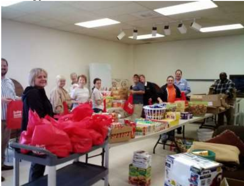
Packing for the Shalom Kids' Sack Lunch Program at Love INC.